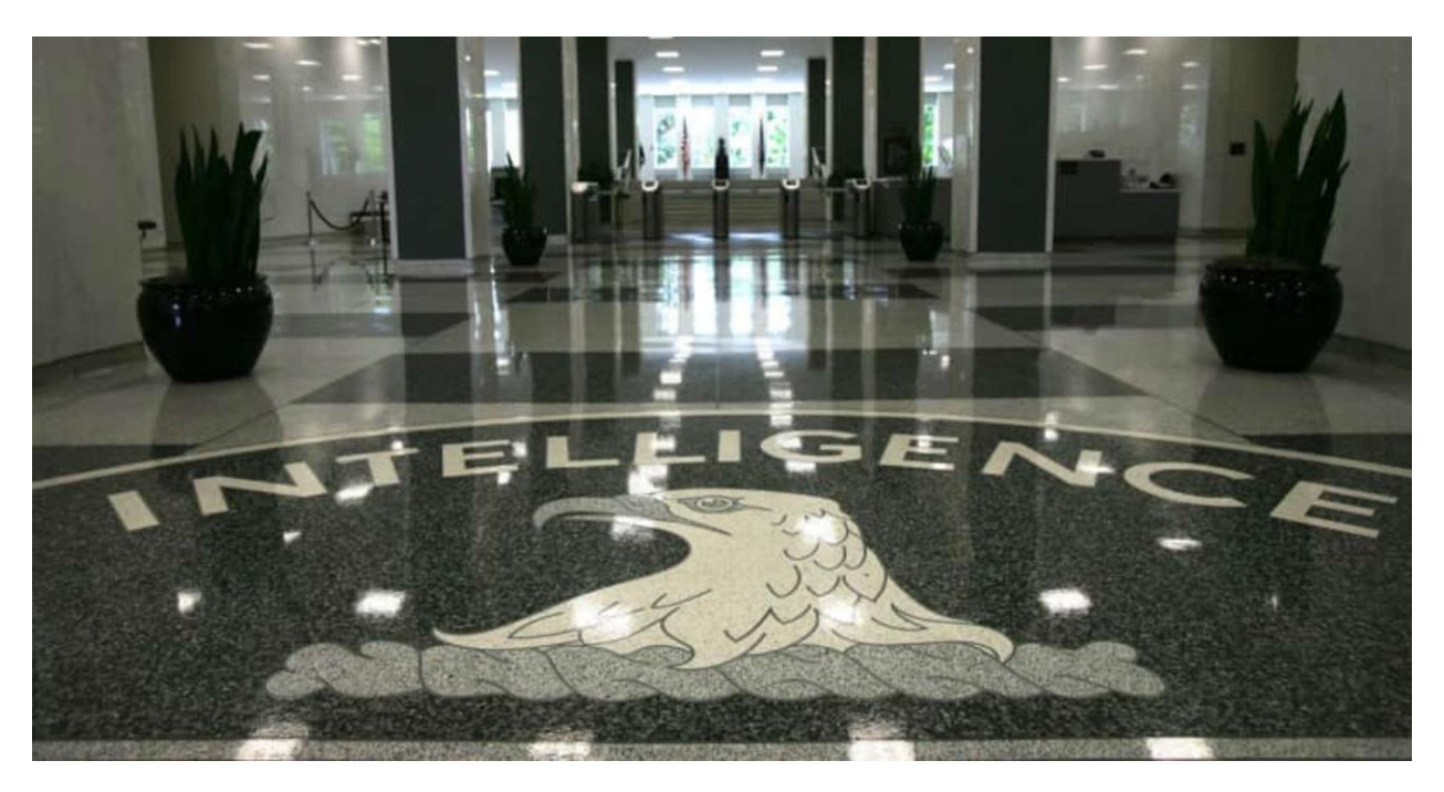
The CIA's Office of Global Access allegedly retrieves UFO debris.

Three sources who spoke to The Daily Mail said the OGA, a wing of the <u>Central Intelligence</u> <u>Agency</u>'s Science and Technology Directorate, had been at the center of retrieving crash debris since 2003.