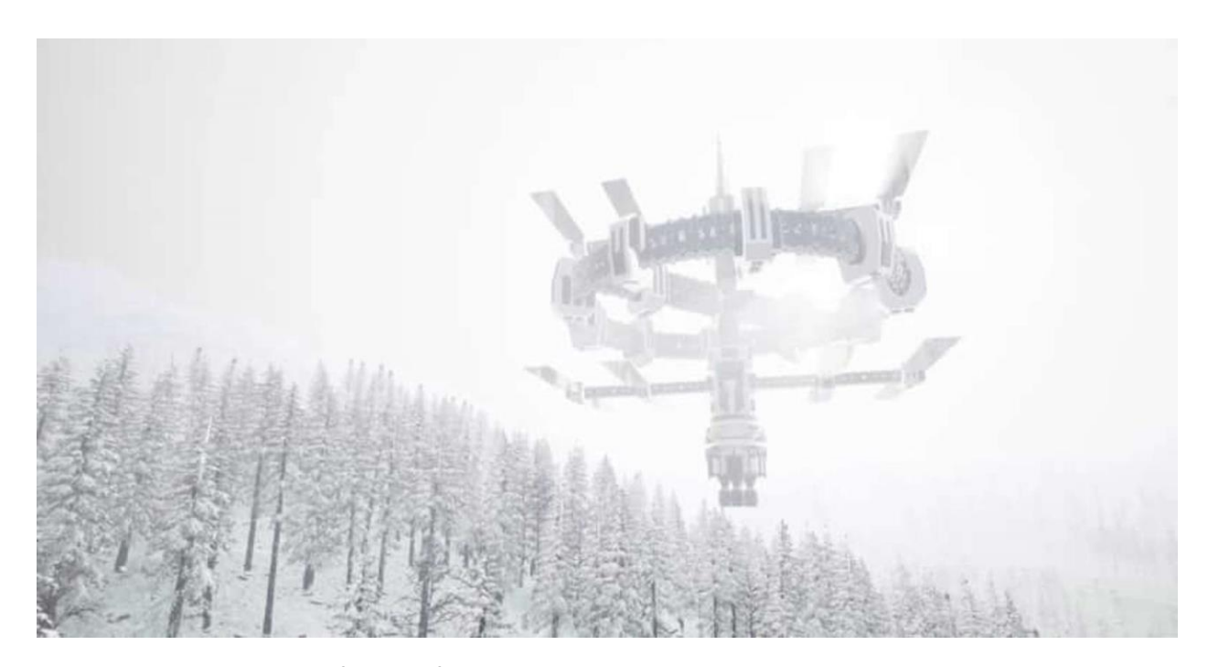
UFOs have been a subject of debate for a long time.

That alleged crash predates the famous Roswell crash in <u>New Mexico</u>, where some believe parts of a UFO were recovered. Conspiracy theorists have gone so far as to theorize that aliens were rescued from the site and taken to <u>military bases</u> for testing.