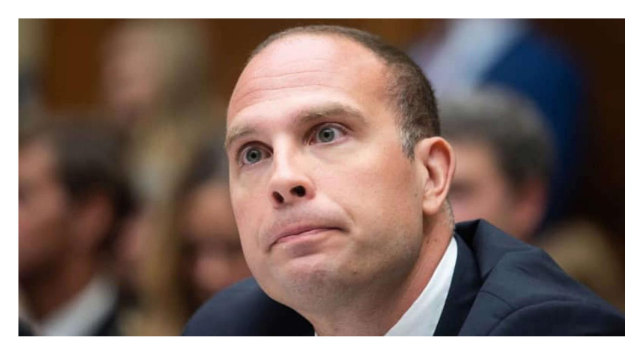
David Grusch says the United States, China and Russia are engaging in a UFO arms race.

While the OGA typically focuses on more conventional retrieval missions, such as finding stray <u>nuclear weapons</u>, downed <u>satellites</u> or adversaries' technology, UFOs are part of the agency's agenda.