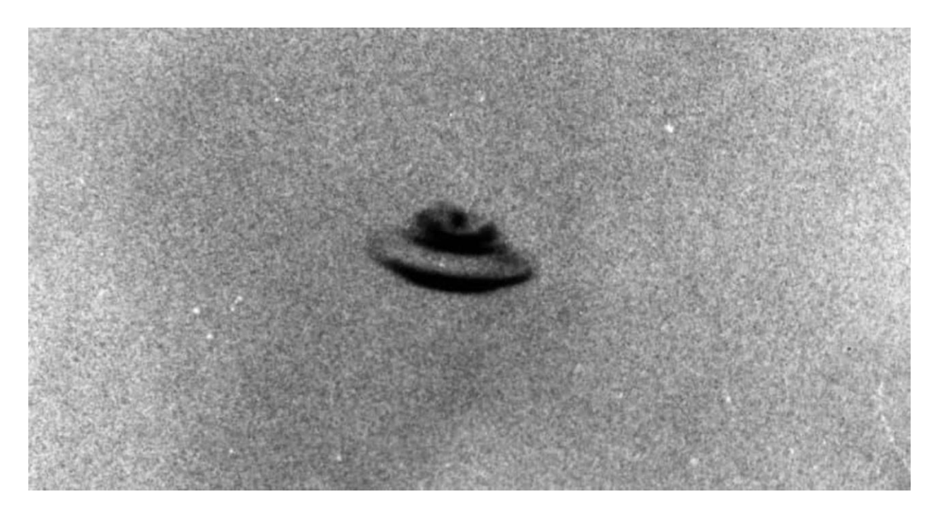
The U.S. government has recently been more forthcoming with information about UFO sightings.

"There's at least nine vehicles. There were different circumstances for different ones," one of the sources said. "It has to do with the physical condition they're in. If it crashes, there's a lot of damage done. Others, two of them, are completely intact."